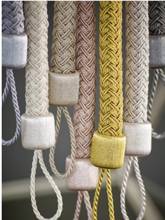
Intricate and refined.

Our beautiful new Tressé Tieband is very much an object of desire. The intricate braided detail is delicate, making this a perfect accessory against a plain fabric or voile.