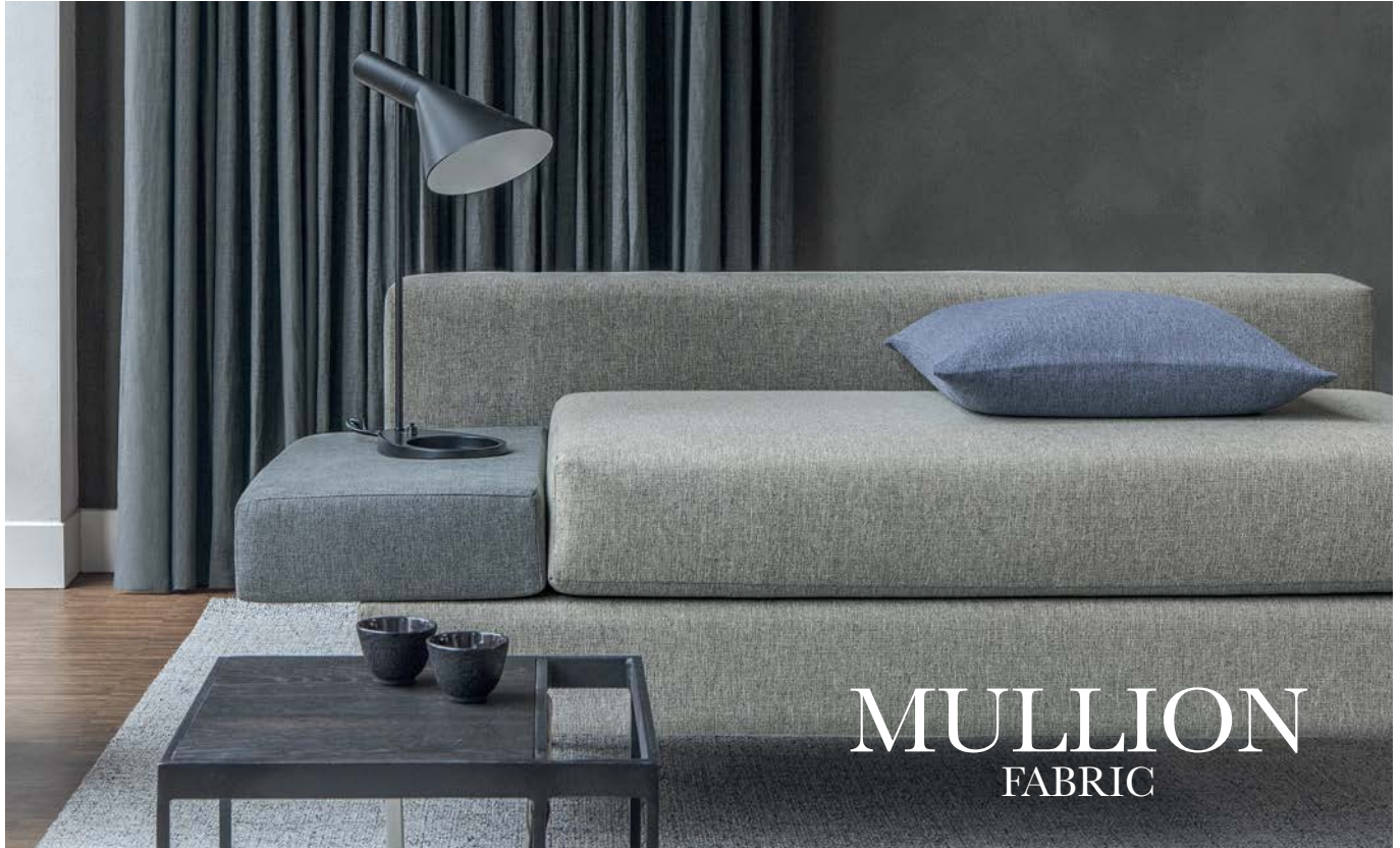
Textured plain with a versatile use.

Inspired by the seaside village of Mullion, home to an array of beaches, coves and cliff-tops, nestled along the stunning Cornish coastline. This textured fabric is versatile in its use with a palette that is based around sandy beach shades with a few pops of colour from surrounding scenery of greens, blues, pinks and greys.