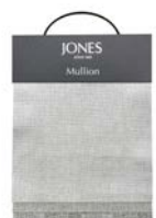
Pattern Book MULLIONPB