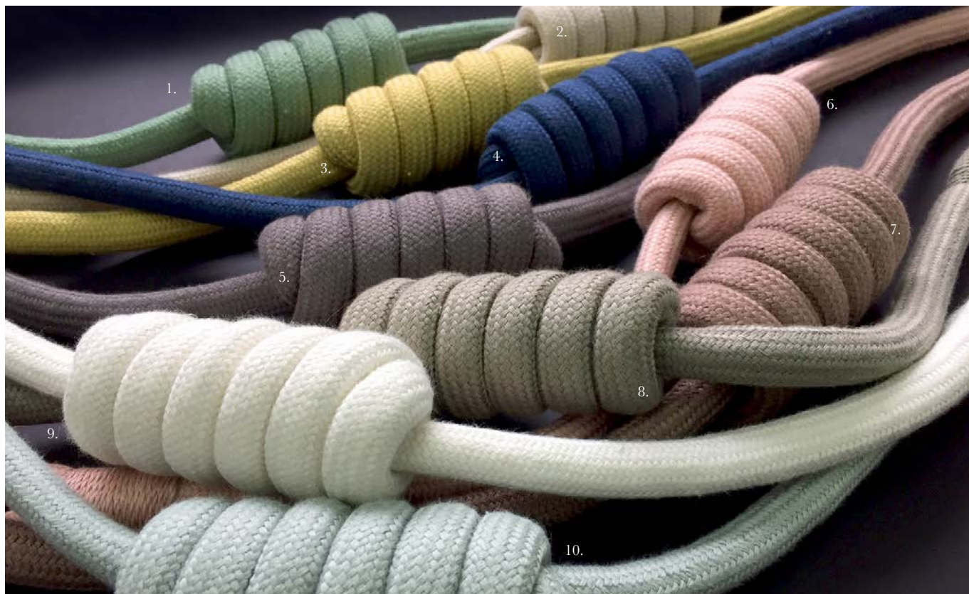
1. herb, 2. smoke, 3. sand, 4. midnight, 5. graphite, 6. blush, 7. truffle, 8. stone, 9. cloud & 10. duck egg.

Effortlessly stylish, made from luxury Italian yarn with a soft matt finish. Perfect for adding casual elegance to cool cottons and light linen fabrics.